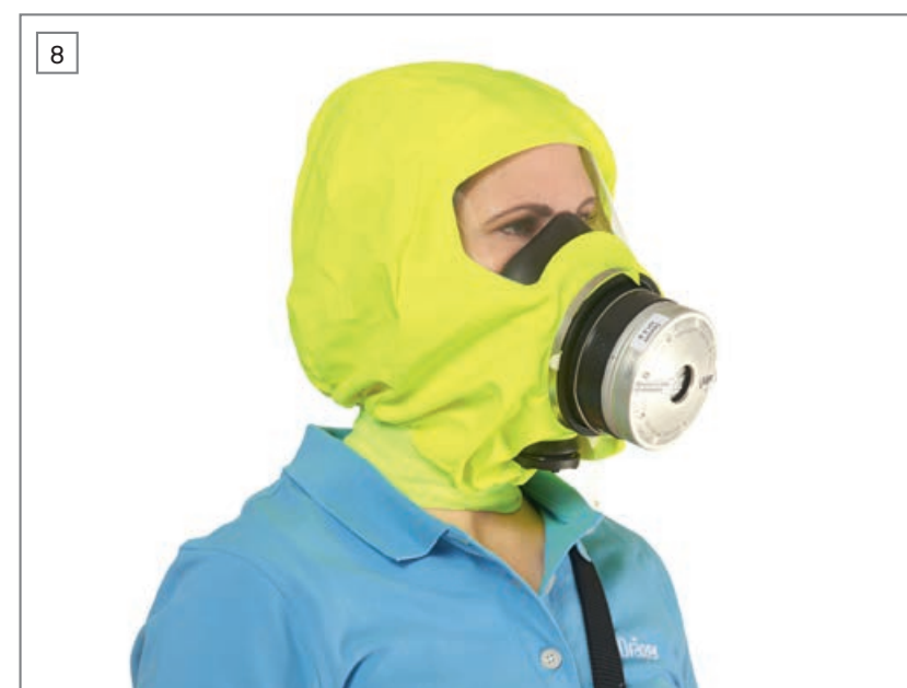
Check the fit of the half mask by closing the front filtering opening with the palm of your hand. If negative pressure is not generated readjust the half mask to ensure a close fit over nose and mouth.